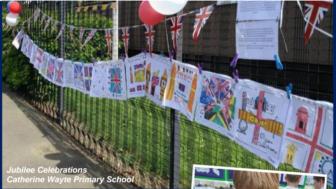
Jubilee Celebrations Catherine Wayte Primary School